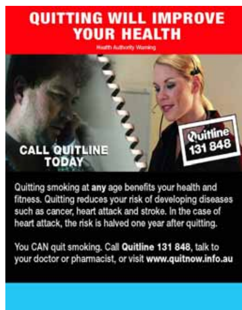
Back of Cigarette Pack (representation only)

Smoking is known to cause harm to nearly every organ and system of your body. It even affects organs that have no direct contact with the smoke itself. 1,2 There is no safe level of tobacco use. 3